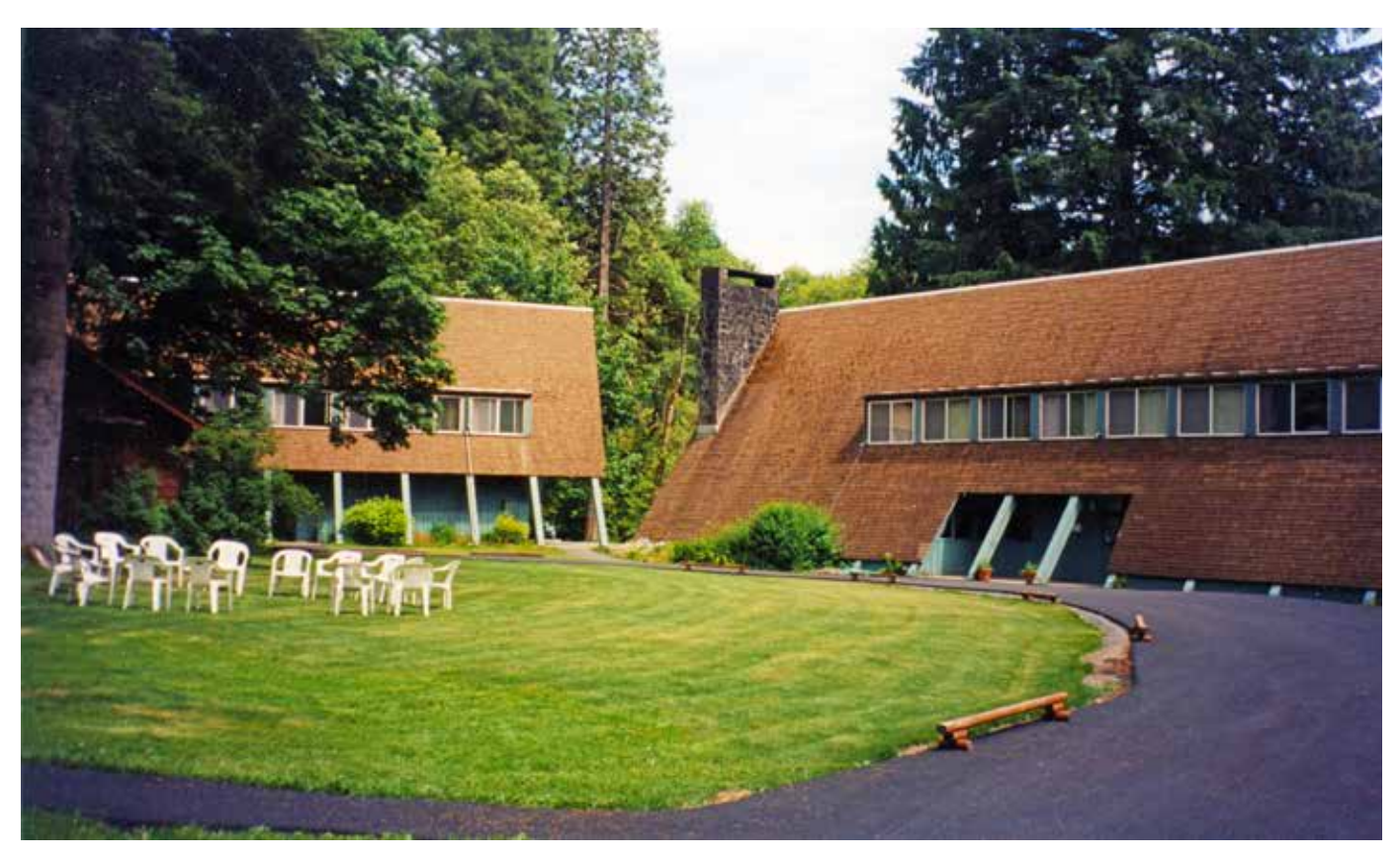
Chairs set up for a class on the lawn, 1990