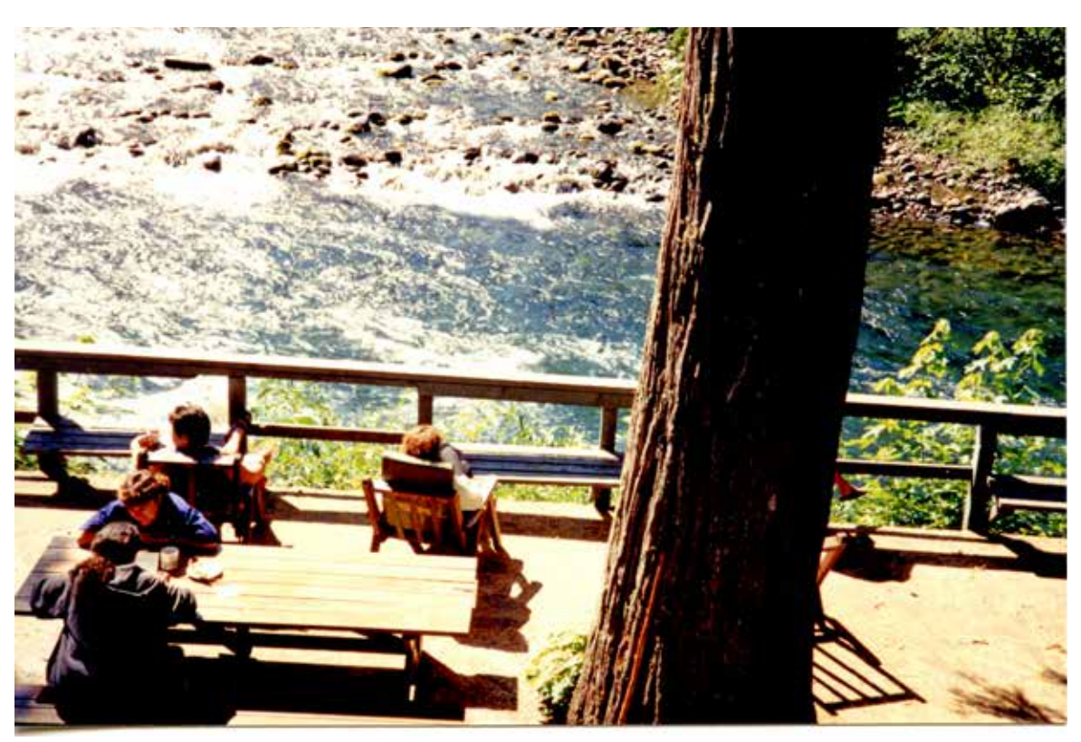
Terrace scene, view from second floor of lodge, 1990